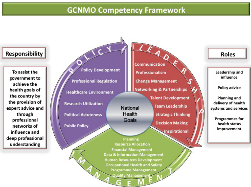
Figure 1. CGMNO competency framework

The schematic representation of the framework contains the list of competencies under each domain and GCNMOs' responsibilities on one side and roles on the other – providing a summary of all the essential components of roles, responsibilities and related competencies in diagrammatic form (see Figure 1).