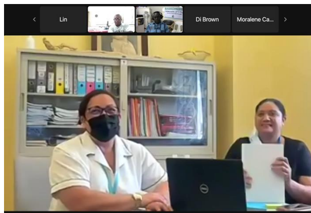
2022 Pacific Leadership Program Fellows from Tonga