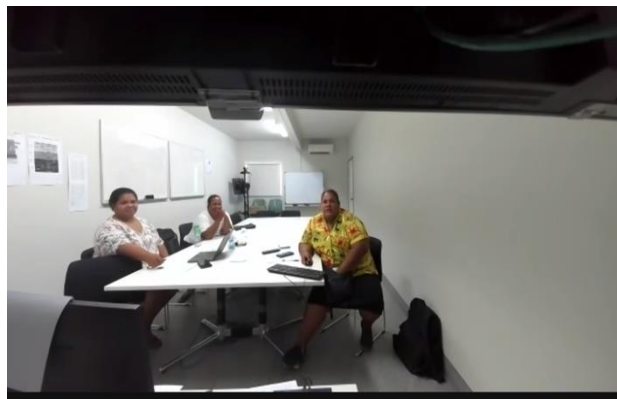
2022 Pacific Leadership Program Fellows from Nauru