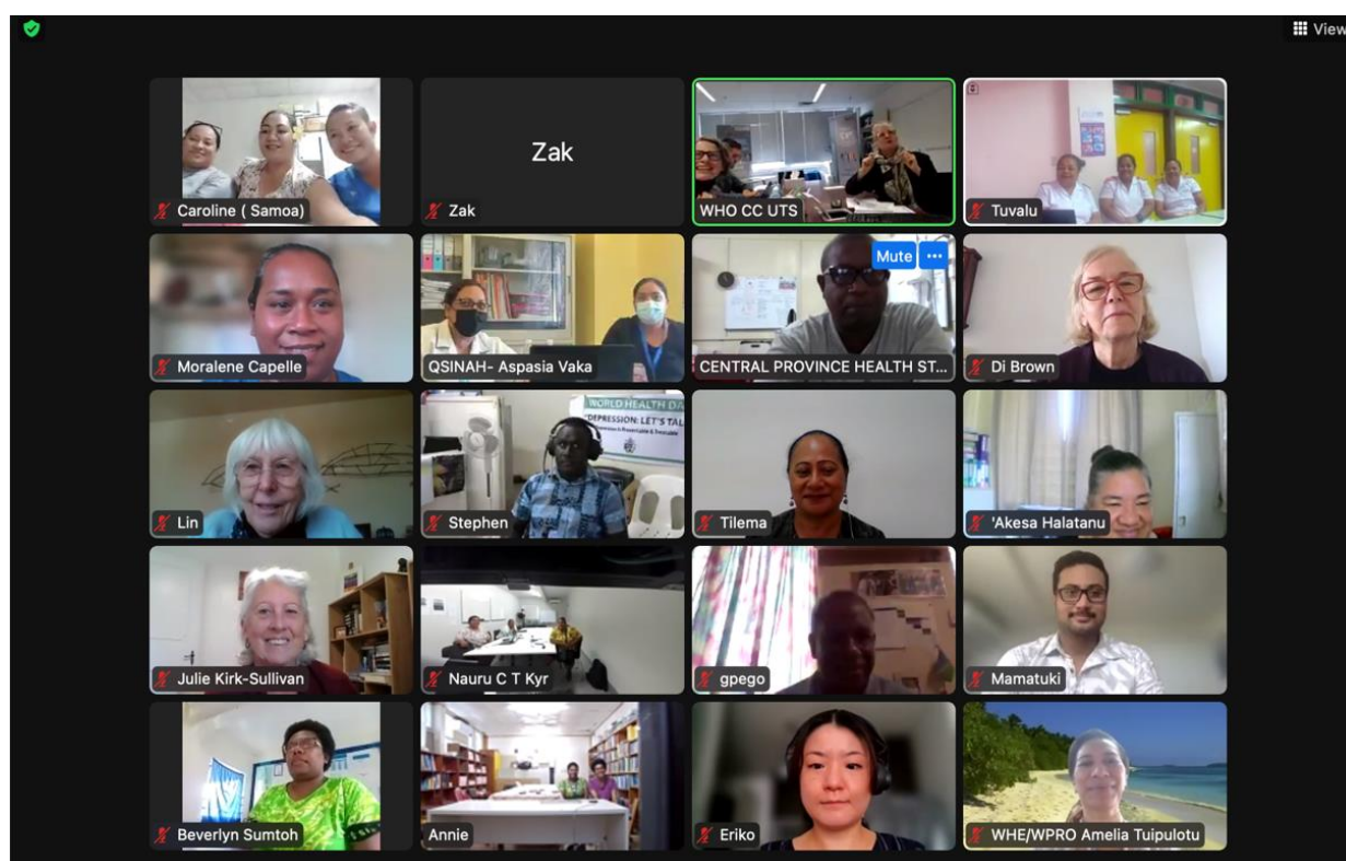
Attendees at the Inaugural Session of the 2022 Pacific Leadership Program