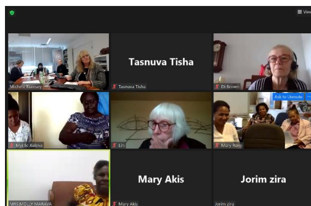
Figure 2: Participants of DGN Subcommittee Meeting

aim to address the key health priorities identified in PNG's National Health Plan, the NDoH baseline survey, the PNG National Sector Review Annual Performance (SPAR) 2019 document, the PNG National Qualifications Framework, and the Gap Analysis of the previous curricula prepared by WHO CC UTS.