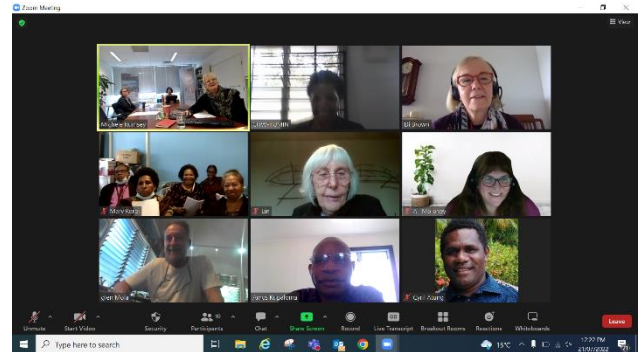
Figure 4: Participants of CHW Subcommittee Meeting

At the CHW Subcommittee meeting, participants reviewed and discussed the CHW Curriculum Framework and draft subject summaries, noting improvements from the current curriculum.