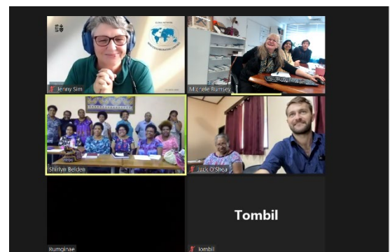
Figure 2: CHW Subcommittee attendees

the upcoming in-country workshop in June. The meeting facilitated feedback from Subcommittee members on gaps and potential improvements.