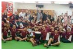
The first UTS Kids' Prom

by Maxim Boon on January 7, 2015 (January 7, 2015) filed under Classical Music | Comment Now