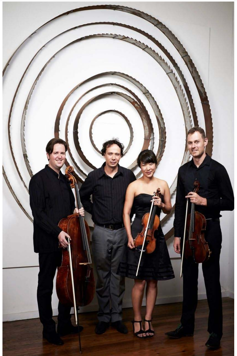
The Australia Piano Quartet