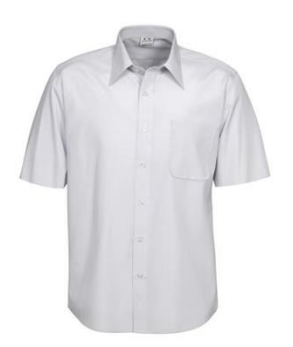
S29510- Men's Short Sleeve Ambassador Shirt