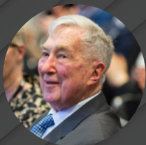
Hon Sir Gerard Brennan AC KBE GBS QC

"To see...future lawyers concerned about law and justice and leadership is an assurance that the future of the rule of law in this country is in good hands. I congratulate the Law Students' Society and the UTS Faculty of Law on their initiative in creating this program."