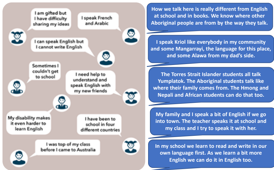
Figure 1: ACARA EAL/D learner infographic with added Indigenous context examples

Note. Excerpt © ACARA (n.d.) English as an Additional Language or Dialect Infographic (box on left), with authors' additions of blue speech bubbles (on right) ( https://www.australiancurriculum.edu.au/resources/student-diversity/meeting-the-needs-of-students-for-whom-english-is-an-additional-language-or-dialect/ )