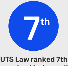
law school in Australia QS World University Rankings by Subject 2021