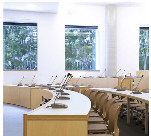
Collaborative theatre.