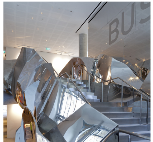
Stainless steel stair. Credit: Andrew Worssam