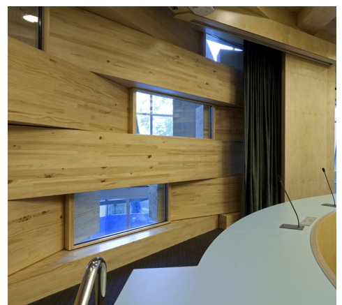
Oval classroom.