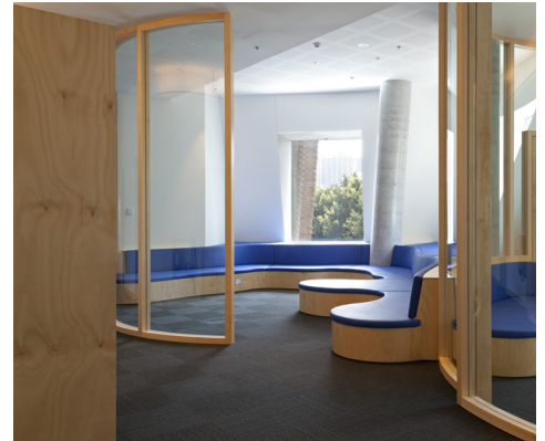
Student commons.

All teaching spaces throughout the building are light-filled and have a wonderful connection to the city. They are designed for collaboration, debate, group work and presentations.