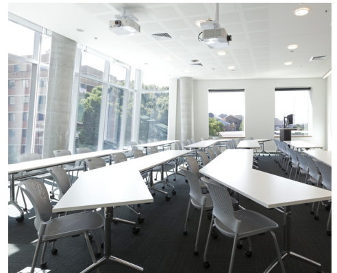
Seminar room.

The building accommodates three student lounges on levels 3 and 4, one incorporating a café and another a well-equipped kitchenette.