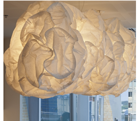
Cloud lighting.

Available as a general space for public lectures and other events, the auditorium is equipped with an advanced audio-visual system and video-conferencing facilities.