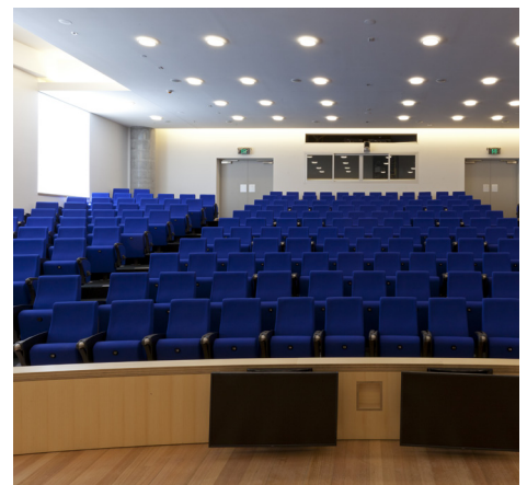
Auditorium.