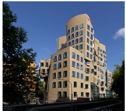
Exterior, eastern façade.