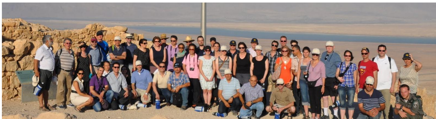
(Pictured Above): Delegates from the International Fingerprint Research Group at Masada