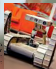
Front cover: The iRobot Packbot used for research in mobile rescue at the UTS Centre for Intelligent Mechatronic Systems.